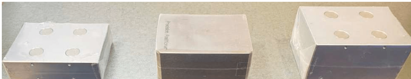
DVT-FP100-1N 1 in (2.54 cm)