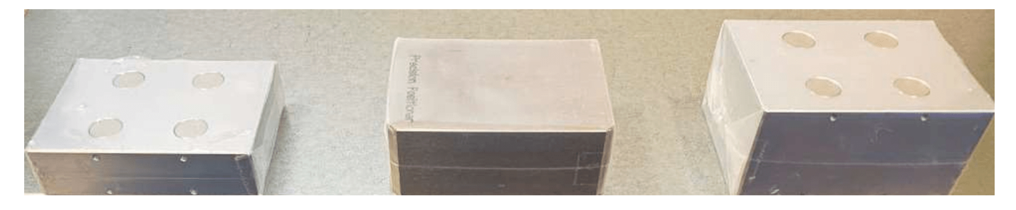
DVT-FP100-1N 1 in (2.54 cm)