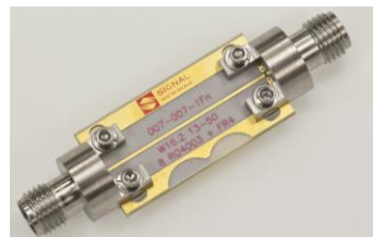
Photograph of actual board tested

1" microstrip test board with typical data through 40 GHz