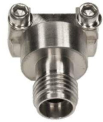
ELF40 Common Interface